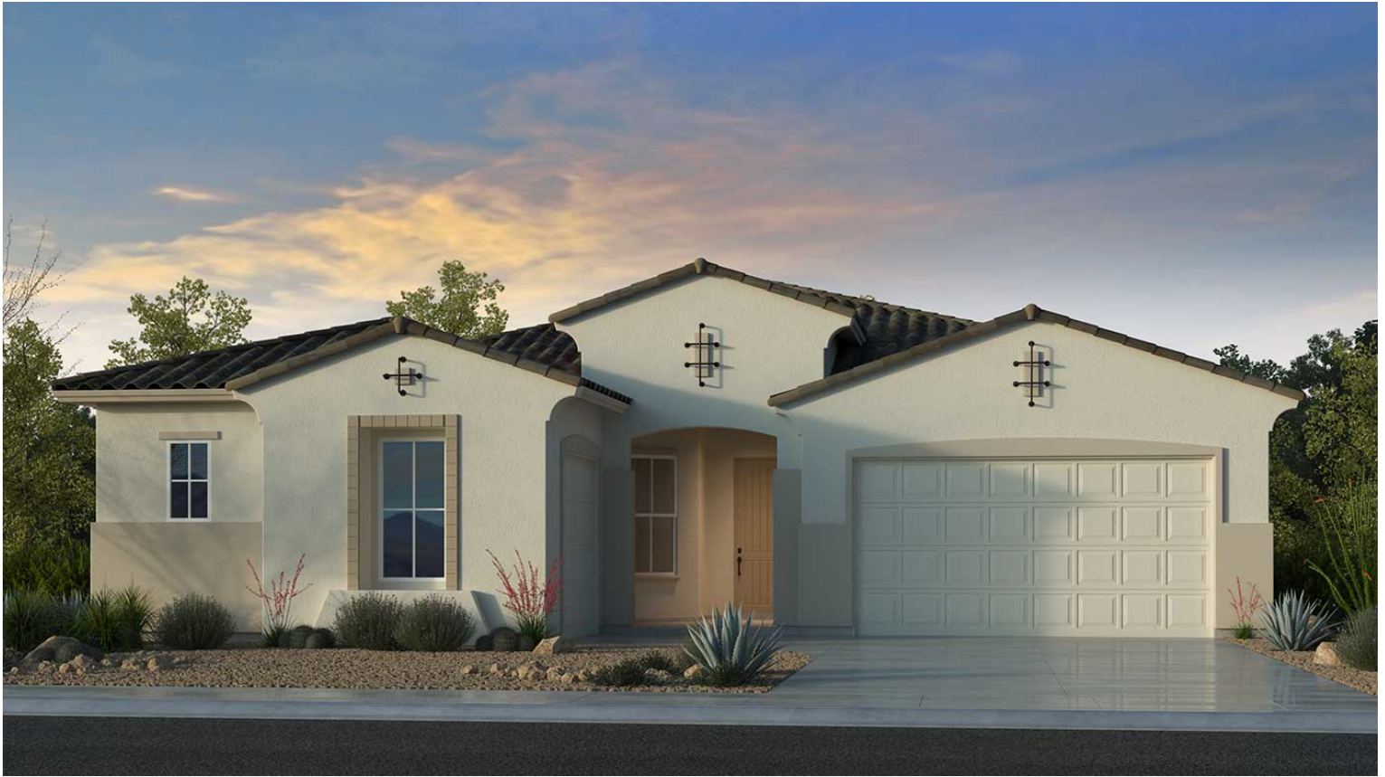
Elevation A - Spanish