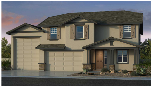
Elevation B - Ranch