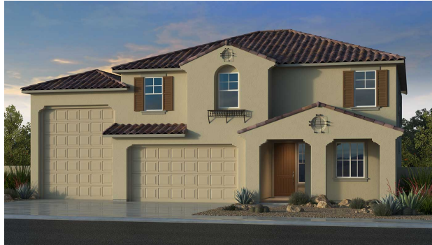
Elevation A - Spanish