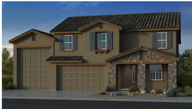
Elevation I - Territorial