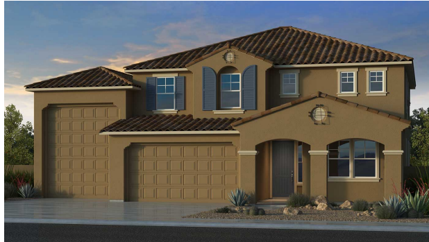
Elevation A - Spanish