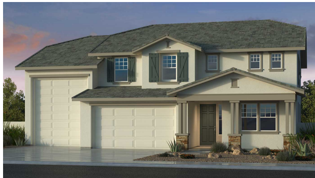
Elevation B - Ranch