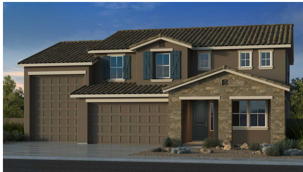
Elevation I - Territorial