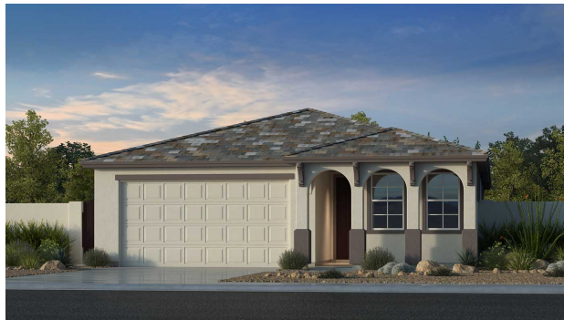
Elevation F - Mission