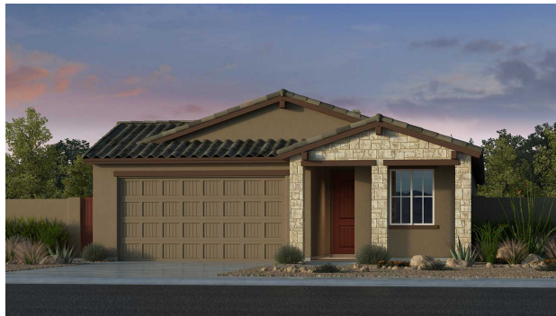
Elevation D - Tuscan