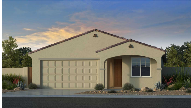
Elevation A - Spanish