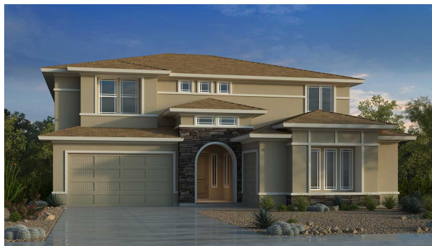
Elevation E - Prairie