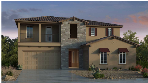
Elevation D - Tuscan