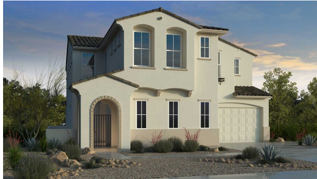
Elevation A - Spanish