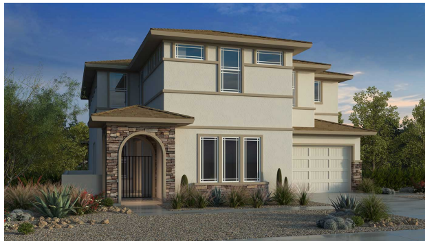
Elevation E - Prairie