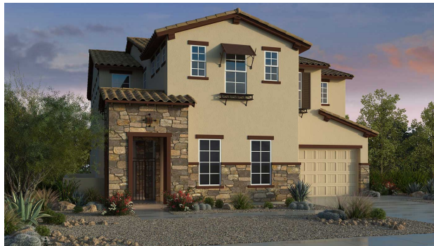
Elevation D - Tuscan