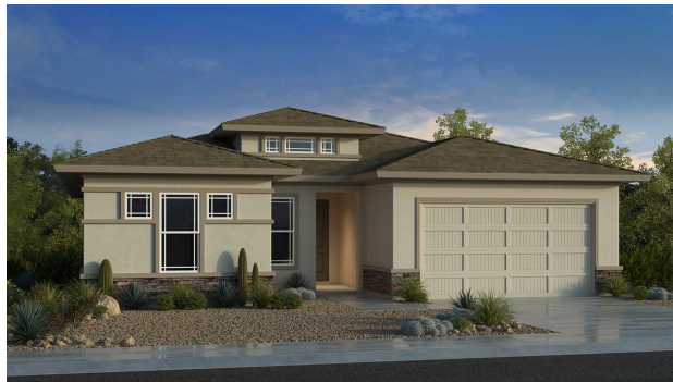
Elevation E - Prairie