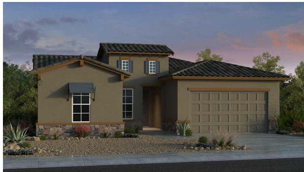
Elevation D - Tuscan