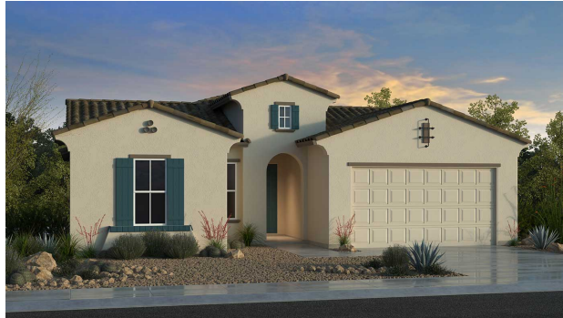
Elevation A - Spanish