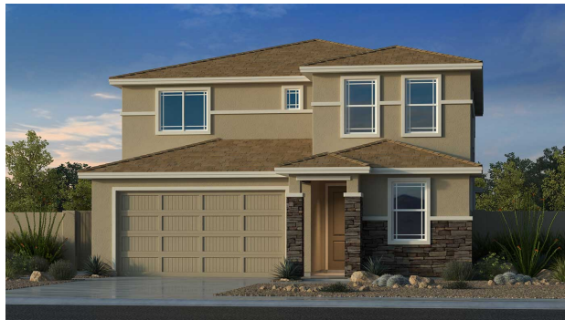
Elevation E - Prairie