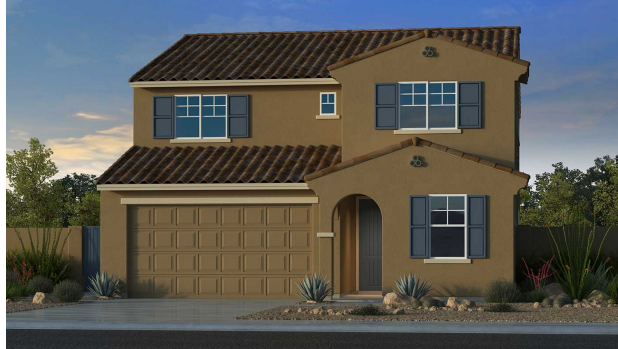
Elevation A - Spanish