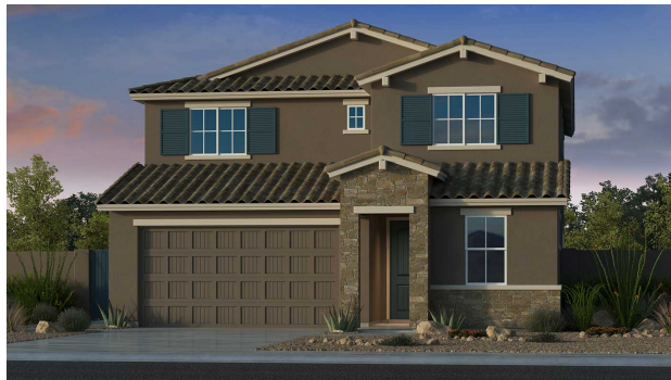
Elevation D - Tuscan