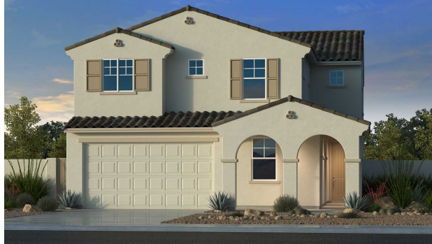
Elevation A - Spanish