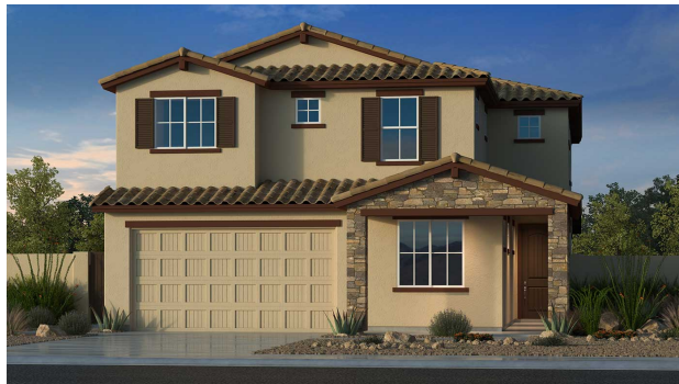
Elevation D - Tuscan