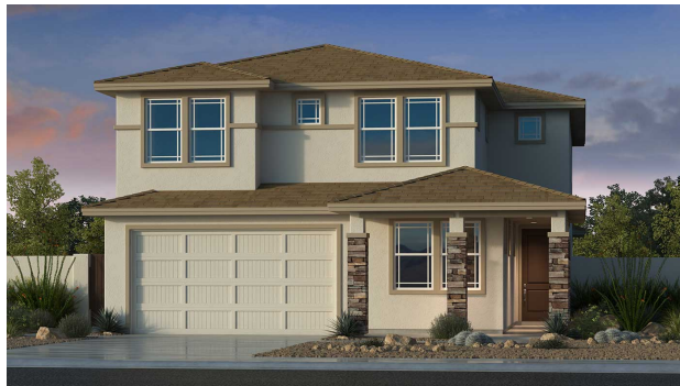
Elevation E - Prairie