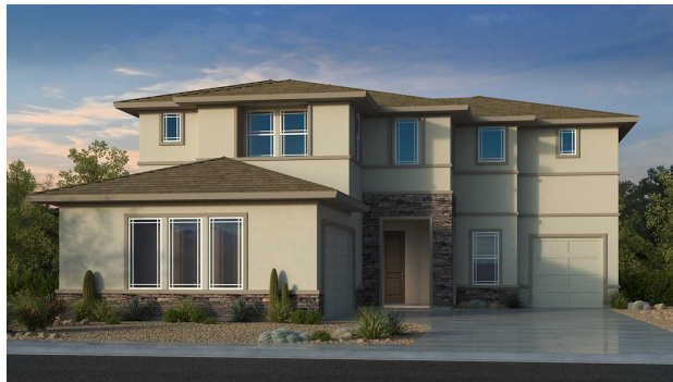
Elevation E - Prairie