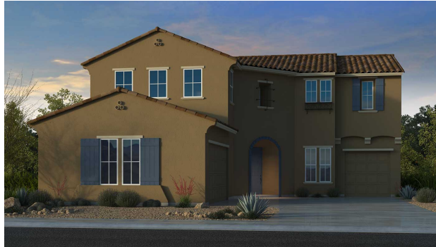
Elevation A - Spanish