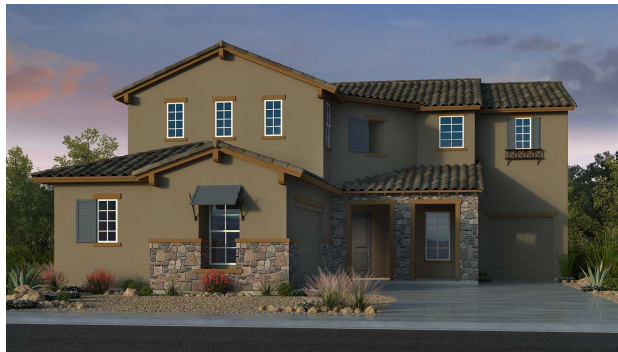
Elevation D - Tuscan