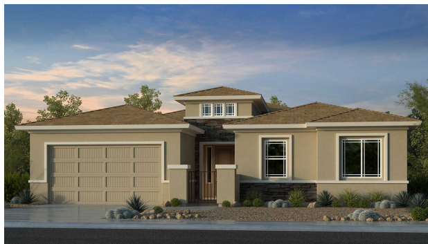
Elevation E - Prairie