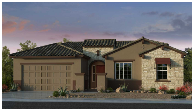
Elevation D - Tuscan