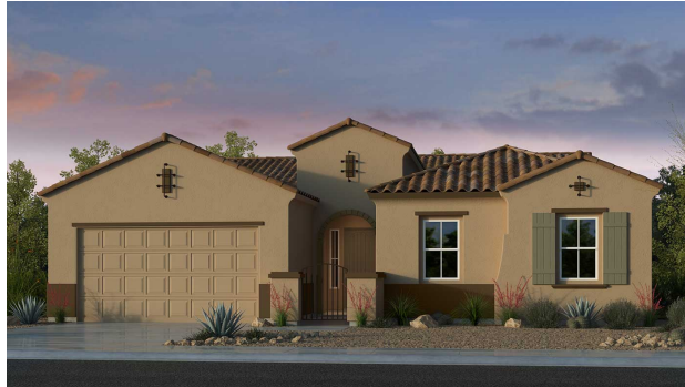
Elevation A - Spanish