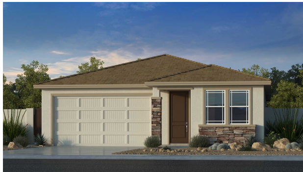
Elevation E - Prairie