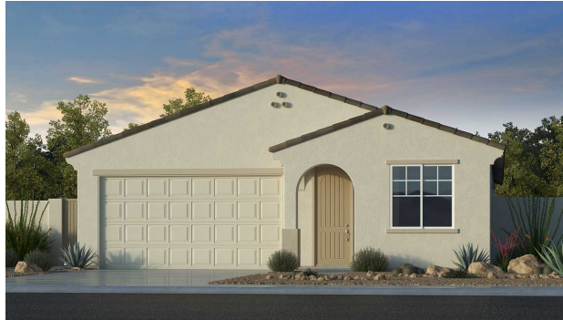
Elevation A - Spanish