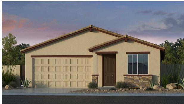
Elevation D - Tuscan