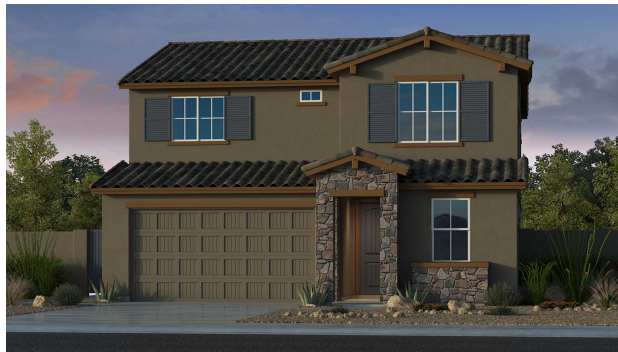
Elevation D - Tuscan