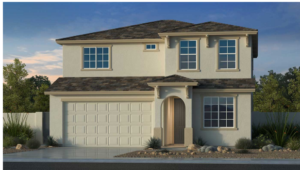
Elevation F - Mission