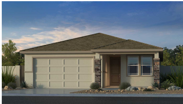
Elevation E - Prairie