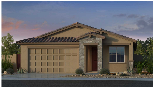
Elevation D - Tuscan