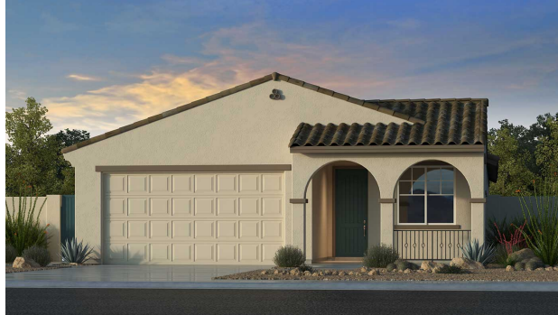
Elevation A - Spanish